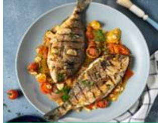
Ready Meals Fish & Fish Alternatives