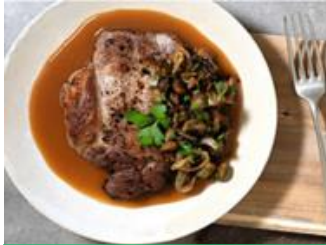
Ready Meals Meat & Meat Alternatives