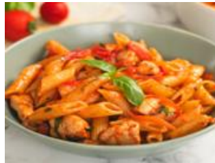
Pasta & Rice