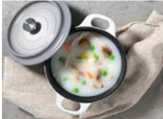
Soups & Stews