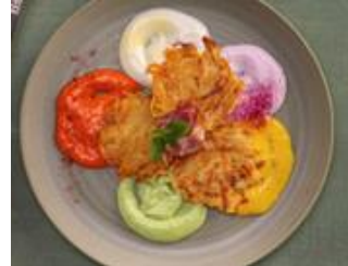
Potato Products & Vegetable