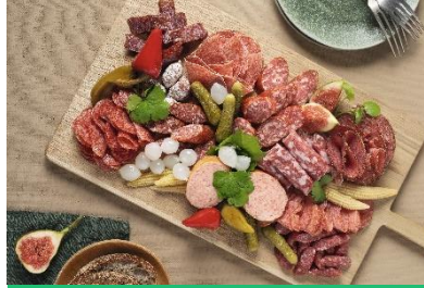
Raw fermented sausage