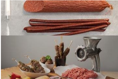
Vegetarian / vegan