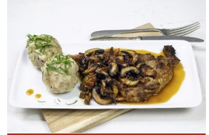
Chilled side dishes (pasta, dumplings)