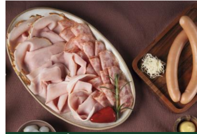
Ready-to-eat, packed sausage products