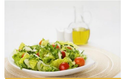
Sliced green salad