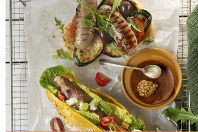
Fresh meat applications