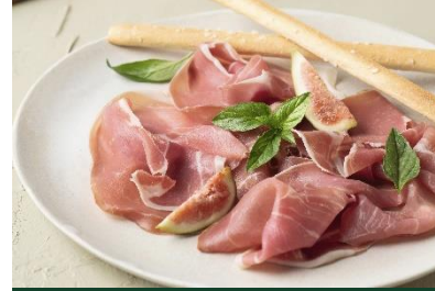
Raw cured meat products