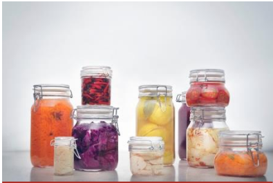
Vegetable juice, vegetables